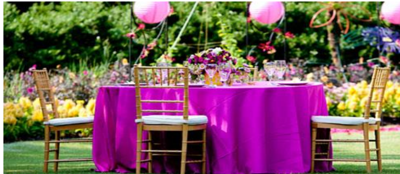
TABLE LINEN & NAPKINS

For Larger Stages, Please Contact Us For Pricing Set Up, Break Down & Delivery Fees Not Included